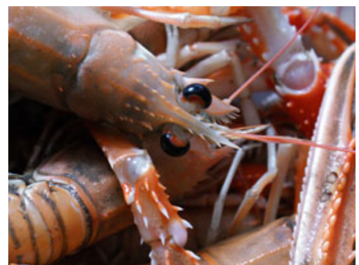
Langoustines on the menu ... just ask