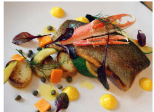
Local produce, beautifully cooked