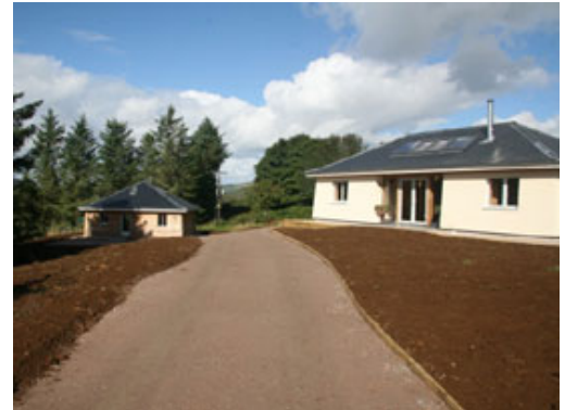
Achabeag ... in step with its surroundings