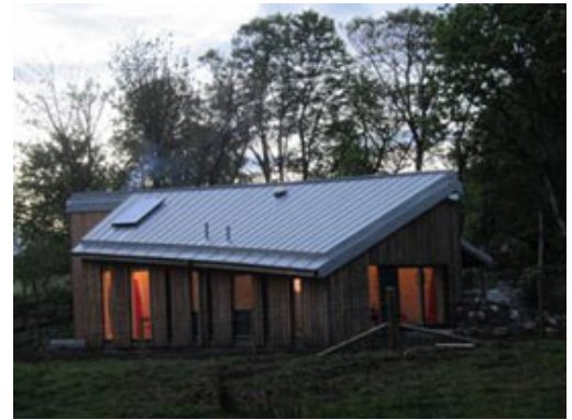
The Studio in the gloaming