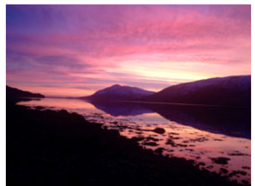
Loch Aline on the way home

At Achabeag, groundworks for the next eight house plots are well underway on the phase below the road, two more houses are