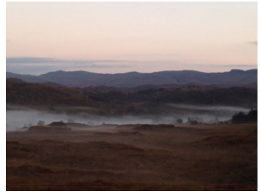
Mist settles over the estate