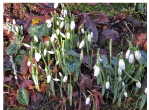
Snow drops in January