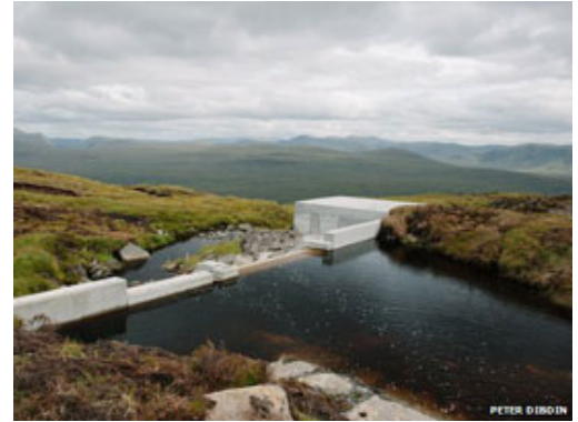
2014 our wettest on record!