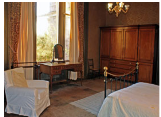
Ardtornish rooms restored ...