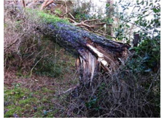
Scots pine felled in the storms